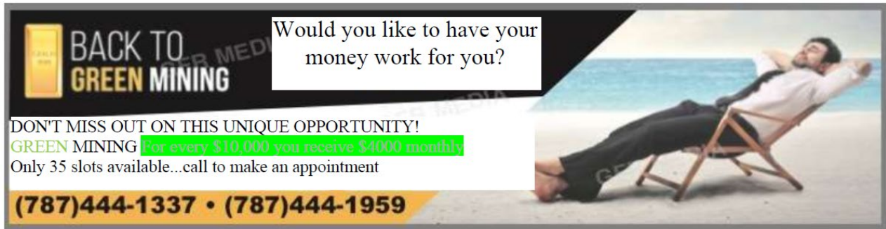
English Translation of the Advertisement

52. The radio ads began to run in October 2016 and continued into June 2017.